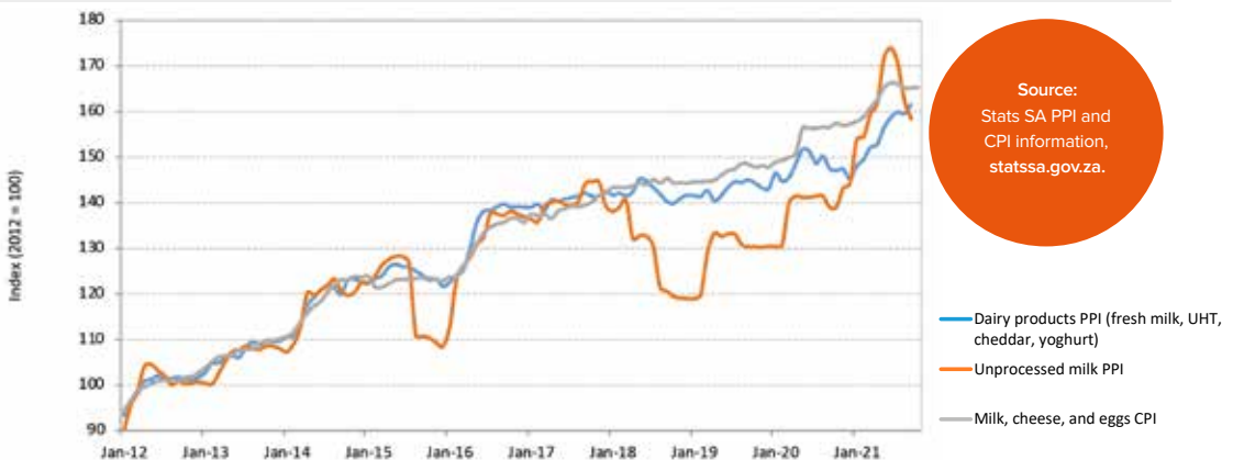
Figure 4 PPI indices of unprocessed milk and dairy products, and the CPI of milk, cheese, and eggs, Jan 2012–Oct 2021