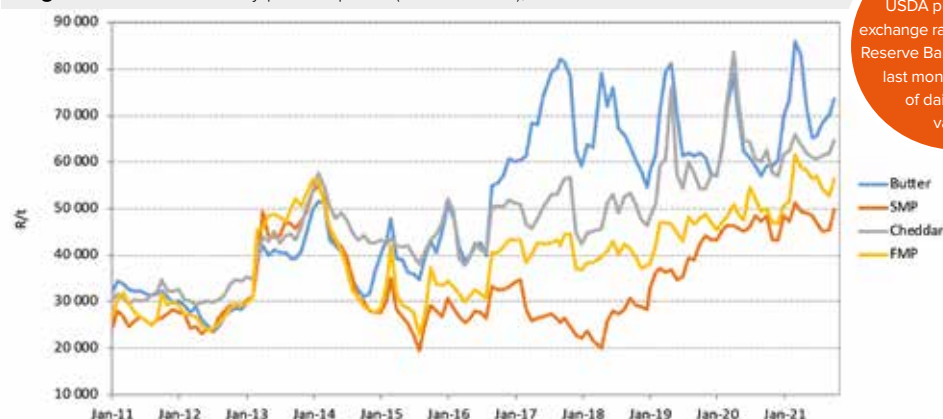
Figure 1 International dairy product prices (free on board), Jan 2011–Oct 2021